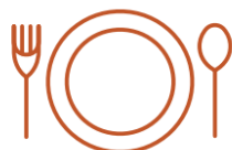
Changing consumption patterns (caused by inflation and dietary trends)