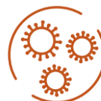
Animal disease risks