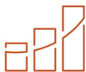
The economy (high production costs)