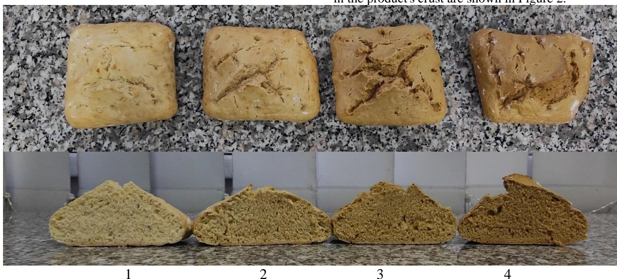
Fig. 1. Photos of Finished Products:

Further research focused on determining the effect of barley malt extract on taste, aroma, and color at a dosage of 3% of flour weight. The aroma formation of products is due to the formation of carbonyl compounds. The research results on the quantity of carbonyl compounds in the product's crust are shown in Figure 2.