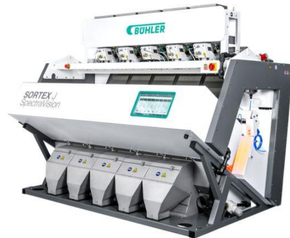
Fig. 2. SORTEX J SpectraVision

Photoelectronic separators SORTEX J SpectraVision are the latest development of this company and