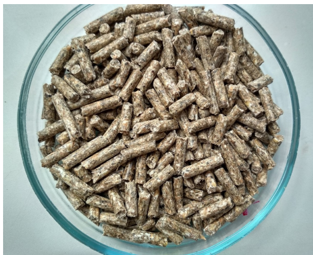
Fig. 4 – Treatment and prophylactic mixed feed "Mix-Feed", produced by CJSC "Ecomol-Agro" for fish farm "Volma"

carp body after wintering become faster, with observed resistance increases, and after 10 days of feeding the fish switch to compound feed for different age carp K-111.