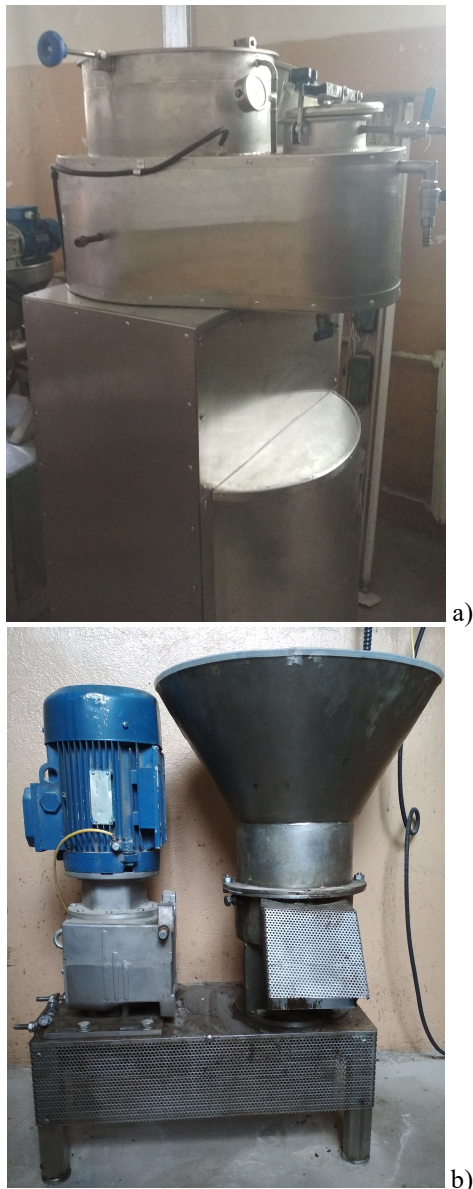
a) – conditioner mixer; б) – flat die press-pelleting machine Fig. 2 – Laboratory conditioner mixer and press-pelleting machine

characterizing the final quality of the feed were selected: feed moisture, swelling and pellet density [8].